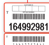
SafeKeeper PLUS Barcode Labels