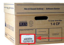
Box Info Panel for large label