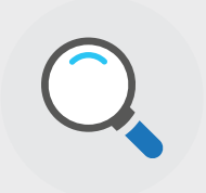
Financial background checking