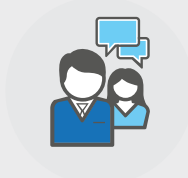
Initial client communications

COVID-19 has not only accelerated digital transformation in many financial services organisations but also changed how clients access information. Artificial intelligence and machine learning are a key part of that digitisation and help to automate processes. For the financial services organisations that do this, it means they are able to speed up many important projects, such as: